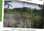
The mere in summer