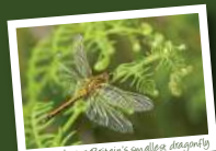
Black damselfly Britain's smallest dragonfly

Take a walk along this delightful trail and enjoy a variety of habitats shaped over thousands of years. Wet heathland, wet woodland, reed beds and drier deciduous woodland all connect together to provide habitats for specialist and rare species of plants and animals.