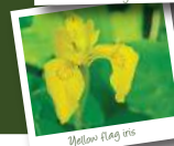
Yellow flag iris