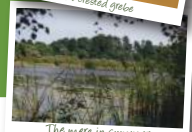
The mere in summer