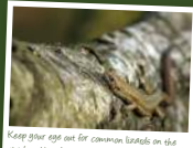
Keep your eye out for common frogs on the mire heathlands