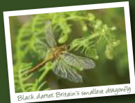
Black damselfly Britain's smallest dragonfly

Take a walk along this delightful trail and enjoy a variety of habitats shaped over thousands of years. Wet heathland, wet woodland, reed beds and drier deciduous woodland all connect together to provide habitats for specialist and rare species of plants and animals.